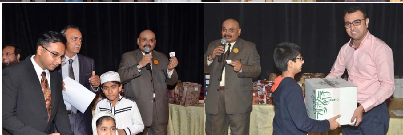
Our sponsors of the event are presenting awards to the outstanding students of the community, Lucky draw also took place during the event and lucky number holders among attendees were given precious gifts.