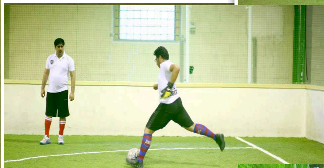
Team Edubbuy Strikers in action

Ph : +971 4 3952318 | Fax : +971 4 3952318 | www.haazirevents.com