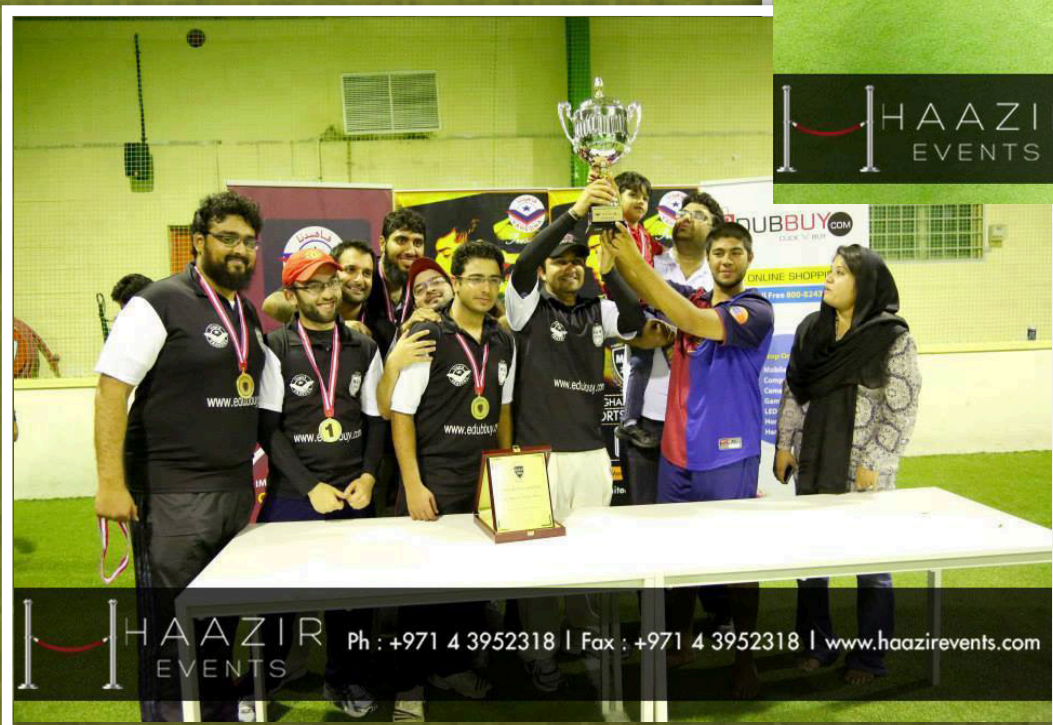
Youth Wing - Winners Cricket

Ph : +971 4 3952318 | Fax : +971 4 3952318 | www.haazirevents.com