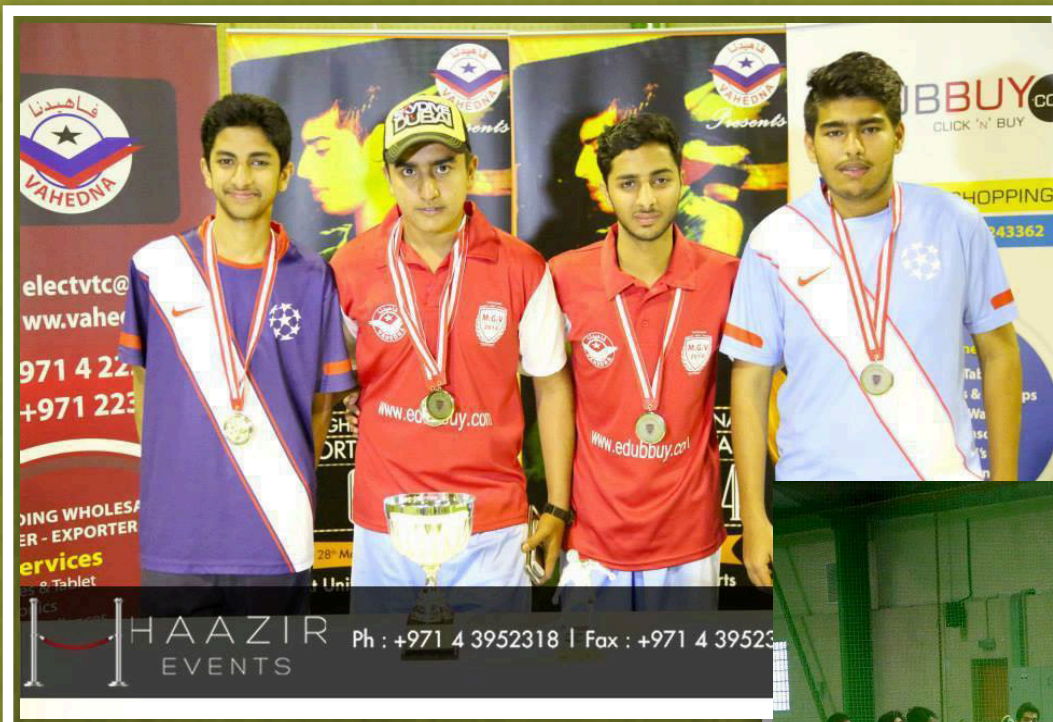
Football Runners up - A Team