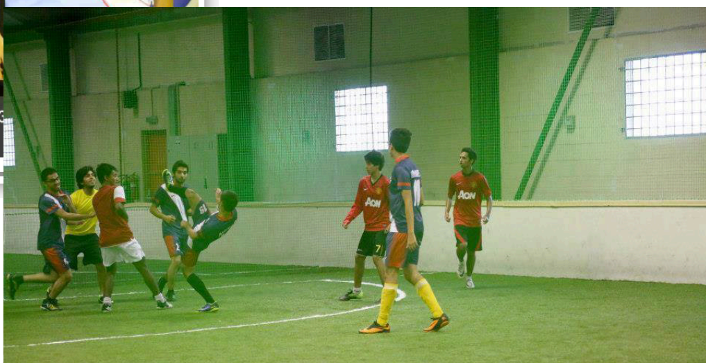
Action from the football match in MGVS '14

Ph : +971 4 3952318 | Fax : +971 4 3952318 | www.haazirevents.com