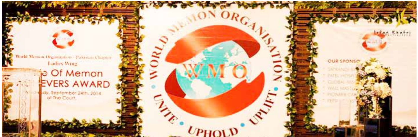
The Compilation of profiles was done by Sumrin Kalia

Post humous Tributes Pride of Memon Achievers Awards 2014 by WMO Ladies Wing Pakistan Chapter