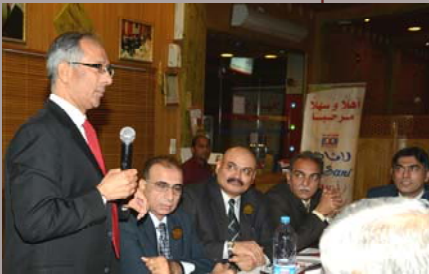
Consul General expressing his valuable views.